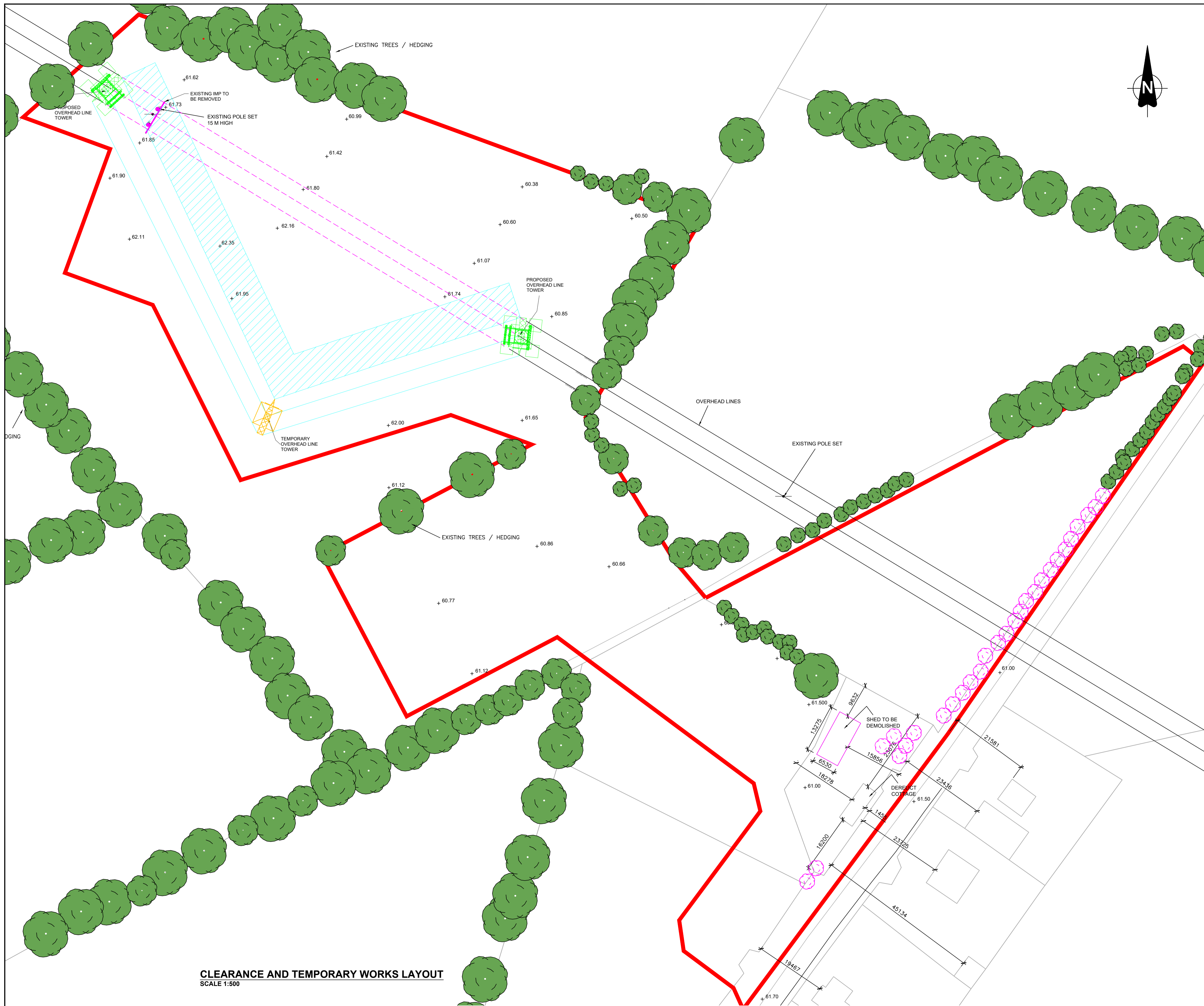
CLEARANCE AND TEMPORARY WORKS LAYOUT SCALE 1:500